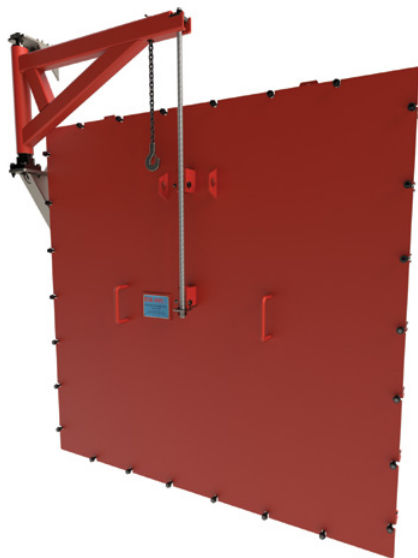
Imtec Catalyst Module Removal Door (Swing Type)

We have over 500 installations of our doors in various plants throughout the U.S. (A reference list is available upon request).