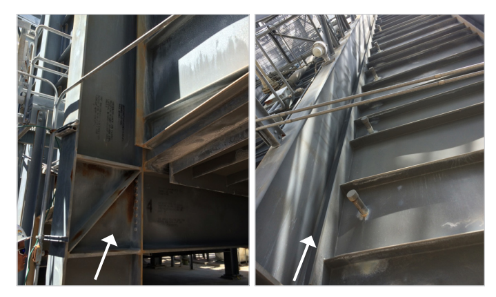
Box 1 column line which will support new grid

Contact Vogt Power International Aftermarket products at 1.888.VOGTPWR or email: aftermarket@vogtpower.com.