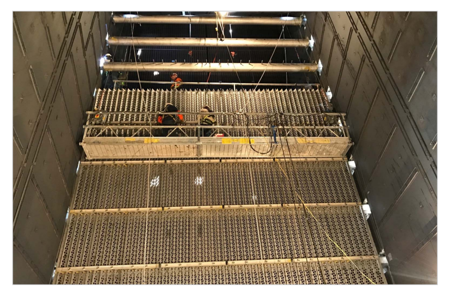
Distribution Grid Layout (looking downstream of gas flow)