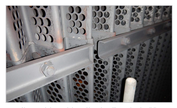
Close up of plate and channel interface, illustrating the sliding connections and range of movement

SAFETY<sup>3</sup> PEOPLE. POWER. PROJECTS.